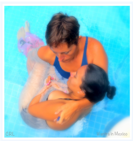
Cost: 1.5 hours session 100 euros.

Warm Water Wantra session (individual or as a couple)